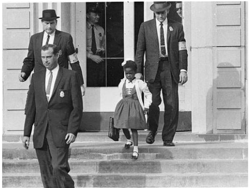
Ruby Bridges, a six-year-old African-American girl is shown on her way into and out of an all-white public school in New Orleans on November 14, 1960 during the process of racial desegregation.